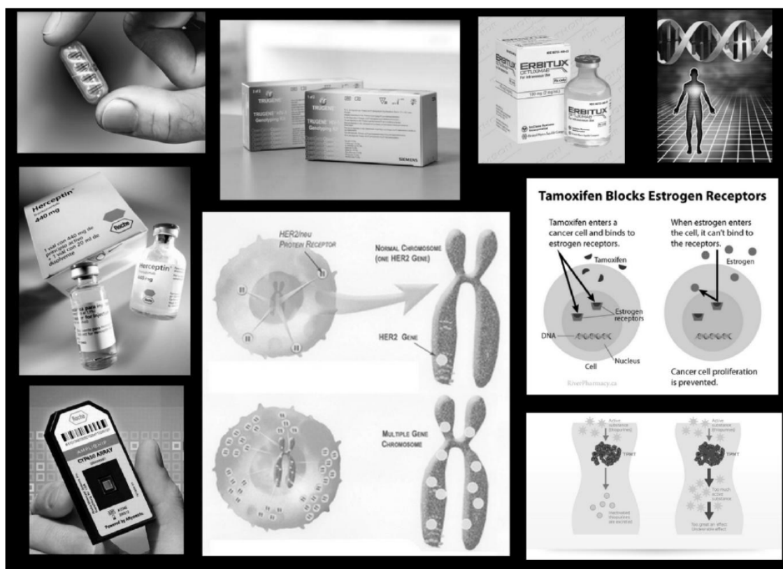
Figure 1: Advancements in the field of personalized medicines.